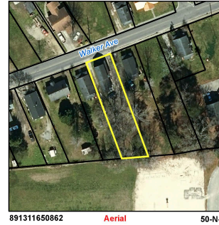
891311650862 Aerial 50-N-8

Primary 10300.0 sq ft @ $1.6/sq ft $16480.0