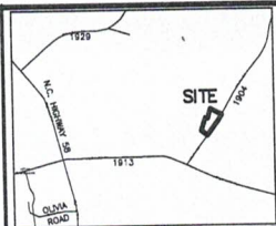
VICINITY SKETCH (NOT TO SCALE)