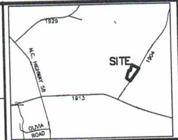
VICINITY SKETCH (NOT TO SCALE)

I, PHILLIP M. TAYLOR, PROFESSIONAL LAND SURVEYOR, CERTIFY THAT THIS MAP WAS PREPARED UNDER MY SUPERVISION FROM AN ACTUAL SURVEY MADE UNDER MY SUPERVISION COMPLETED ON 06/04/2025. FROM REFERENCES AS SHOWN HEREON; THAT BOUNDARIES NOT SURVEYED ARE NOTED AS SUCH AND PLOTTED FROM REFERENCES AS SHOWN HEREON.