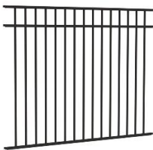
Freedom Black Aluminum style Not a Golf Course Option