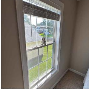
2nd Floor Front Left Bedroom

There are window(s) that suggest evidence of trapped moisture between the panes of glass. The location of the window(s) are provided. It is recommended that a window installer further evaluate the window/s to determine the scope of the discovery and what corrections are needed and repairs done.