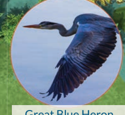
Great Blue Heron (Ardea herodias)