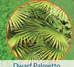
Dwarf Palmetto (Sabal minor)