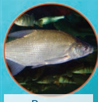
Bream (Abramis brama)