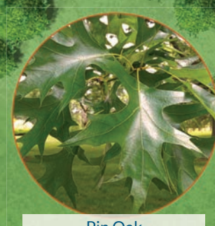
Pin Oak (Quercus palustris)