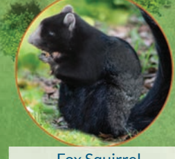
Fox Squirrel (Sciurus niger)