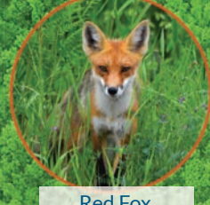
Red Fox (Vulpes vulpes)