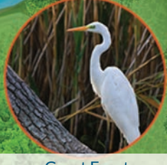
Great Egret (Ardea alba)