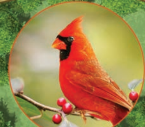
Northern Cardinal (Cardinalis cardinalis)