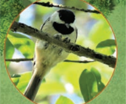
Carolina Chickadee (Poecile carolinensis)