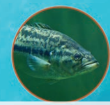
Largemouth Bass (Micropterus salmoides)