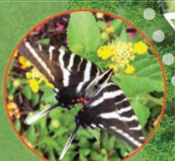
Zebra Swallowtail (Protographium marcellus)