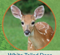
White-Tailed Deer (Odocoileus virginianus)