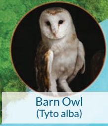
Barn Owl (Tyto alba)