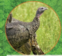
Wild Turkey (Meleagris gallopavo)