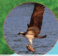
Osprey (Pandion haliaetus)