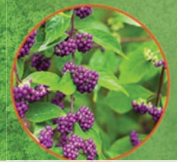
Beautyberry (Callicarpa americana)

Bream & Grass Carp • Kayak & Canoe Racks • Picnic Area • Lake Beach