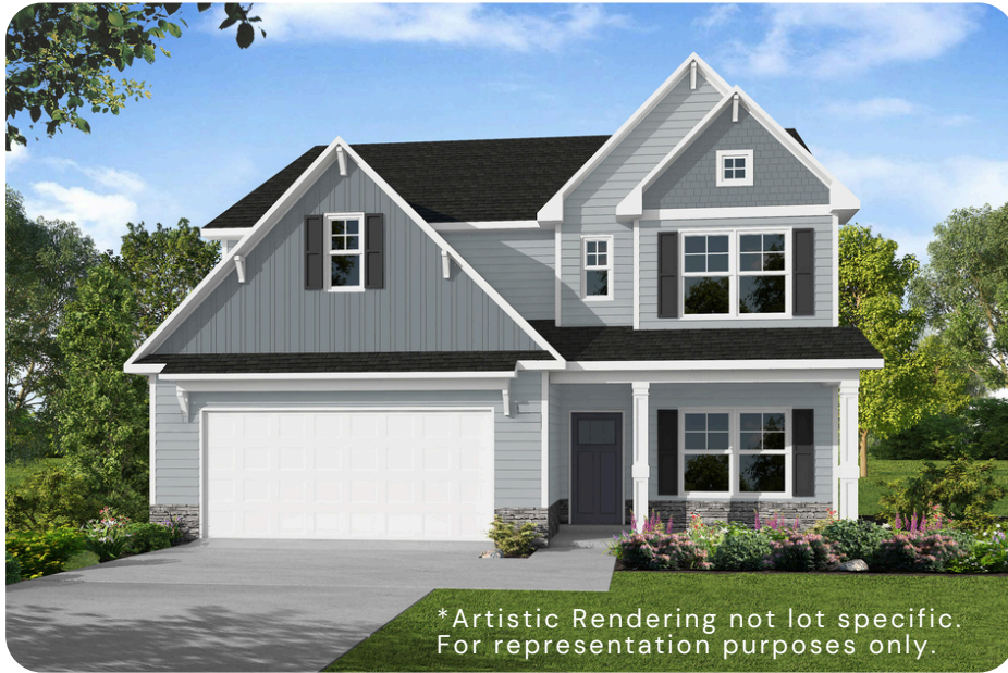
*Artistic Rendering not lot specific. For representation purposes only.

2,695 SQFT | 4 BR | 3.5 BA | 2 CAR GARAGE W/ GOLF CART GARAGE