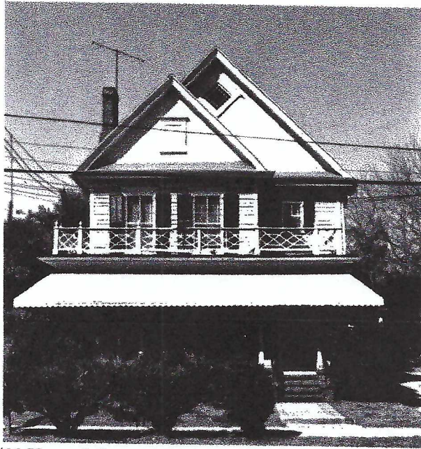
405 Hancock Street