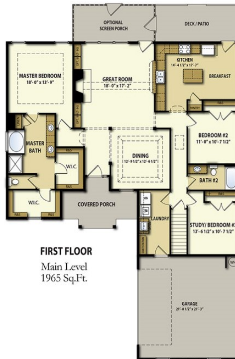
FIRST FLOOR Main Level 1965 Sq.Ft.