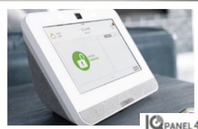
Wireless Security System

INTELLIGENT & PROTECTED HOMES FOR EFFORTLESS LIVING