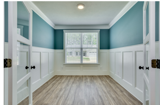
INTERIOR IMAGE: STUDY