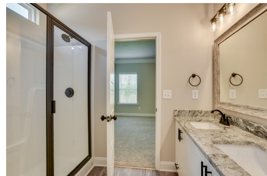
INTERIOR IMAGE: OWNERS BATH

Room sizes may vary due to selected elevation. Square footages are approximate and are subject to changes based on construction materials. Not all models or options are offered at all neighborhoods or in all states. As we are constantly improving our home plans, we reserve the right to change product features, brand names, architectural design, and details. See our neighborhood specialists for additional information regarding availability or models and options. Floor plans and renderings are for illustrative purposes only and are subject to change without notice. Renderings show optional upgrades that may not be included in each home. Materials, specifications and colors may vary per plan and per neighborhood.