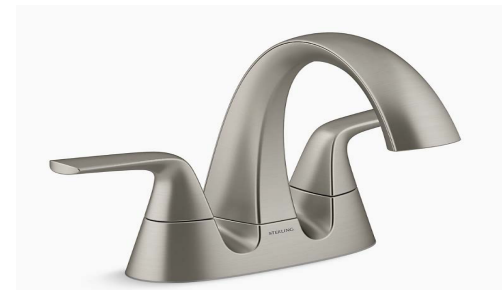
Brushed Nickel Finishes