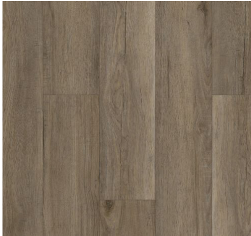
Mohawk Flooring Simply Ecu 860