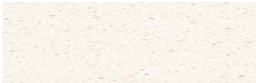
Kitchen Countertops Quartz - Frost White