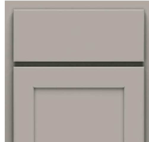
Cabinetry Shaker Grey