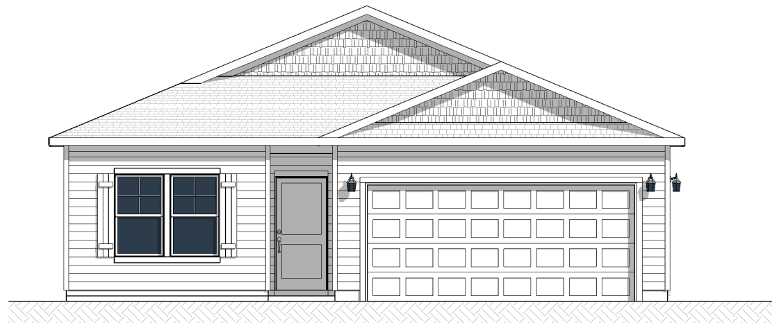
FRONT ELEVATION - C CS