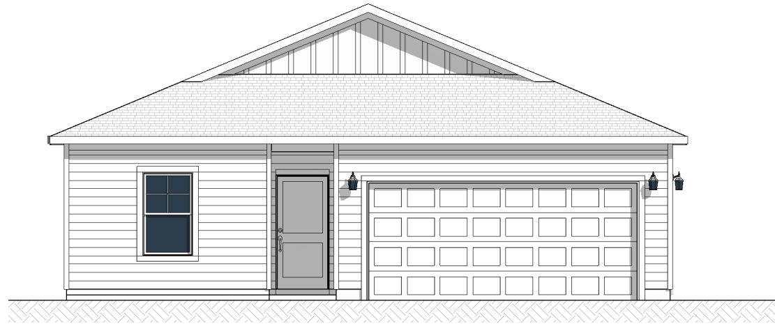
FRONT ELEVATION - B CS