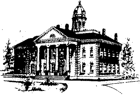
CARTERET COUNTY COURT HOUSE