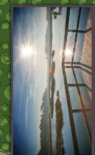
3 Community Pier & Dock Intracoastal Waterway Overlook with Firepit, Seating Area and Canoe & Kayak Launch