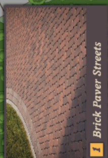
1 Brick Paver Streets