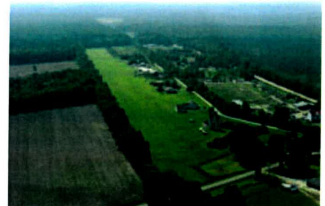
Photo taken 19-Jun-2007 looking down runway 29

Do you have a better or more recent aerial photo of Stag Air Park that you would like to share? If so, please send us your photo.