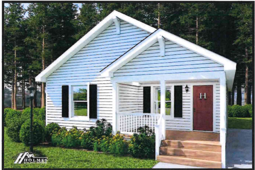
Elevation Shown with Optional and On-Site Builder Supplied Items. Consult Your Builder for Pricing.

Model 5425A HBSE R Approx. 1334 Sq.Ft. (Includes Porch)