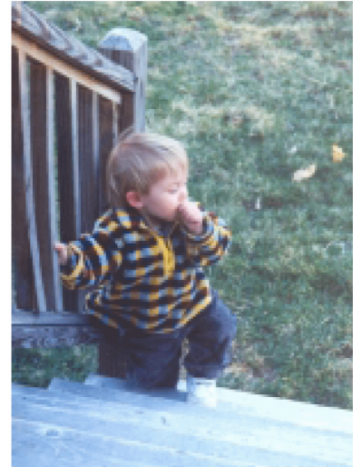
Children touching unsealed treated wood, and then putting their hands in their mouths is the biggest concern.

Too much arsenic can cause cancer. So it is good to prevent arsenic getting into your body when you can. When you touch wood treated with arsenic, you can get arsenic on your hands. The arsenic on your hands can get into your mouth if you are not careful about washing before eating. Young children are most at risk because they are more likely to put their hands in their mouths. The good news is that there are simple things you can do to protect yourself and your family from arsenic treated wood. This fact sheet will tell you how.