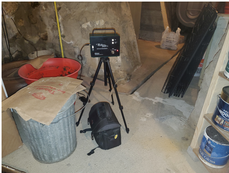
Monitor #14, Basement, Calibrate 5-8-26