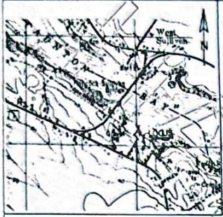
Location Map Not to Scale