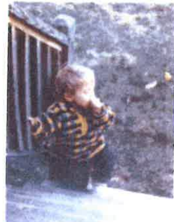
Children touching unsealed treated wood, and then putting their hands in their mouths is the biggest concern.

Too much arsenic can cause cancer. So it is good to prevent arsenic getting into your body when you can. When you touch wood treated with arsenic, you can get arsenic on your hands. The arsenic on your hands can get into your mouth if you are not careful about washing before eating. Young children are most at risk because they are more likely to put their hands in their mouths. The good news is that there are simple things you can do to protect yourself and your family from arsenic treated wood. This fact sheet will tell you how.