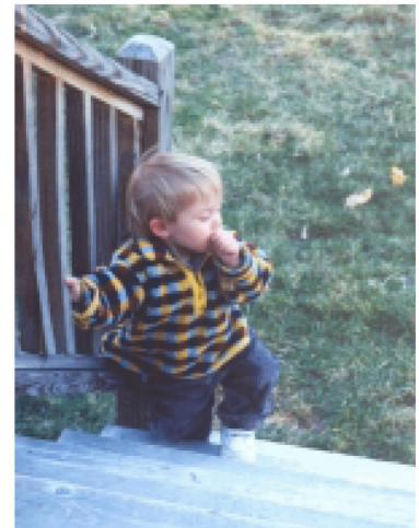
Children touching unsealed treated wood, and then putting their hands in their mouths is the biggest concern.

Too much arsenic can cause cancer. So it is good to prevent arsenic getting into your body when you can. When you touch wood treated with arsenic, you can get arsenic on your hands. The arsenic on your hands can get into your mouth if you are not careful about washing before eating. Young children are most at risk because they are more likely to put their hands in their mouths. The good news is that there are simple things you can do to protect yourself and your family from arsenic treated wood. This fact sheet will tell you how.